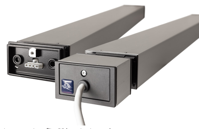
Interconnectors fit within actuator end cap. Can be plugged into either side of the actuator.

Discuss with AFI Sales & Support for your specific project/profile.